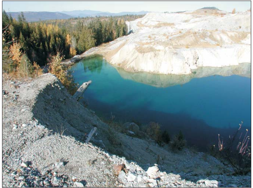
Figure 4. West End pit lake. Note glacial alluvium slope in foreground. View to the northwest.

lamation of portions of the post-1971 waste rock dumps, Equinox started mining in March 1991 and continued until February 1993, at which time the mill was shut down and the property placed on inactive status. No mining has taken place since that time. Equinox mined a total of 1.27 million tons, of which 0.27 million tons are classified as proven ore at a cutoff grade of 2 percent combined lead and zinc. Equinox Resources became a wholly owned subsidiary of Mano River Resources, Ltd., of the UK in 1998. Mano River/Equinox accomplished some mitigation work on the tailings impoundments after cessation of mining, but failed to meet the conditions stipulated in the reclamation permit. The Washington State Department of Ecology