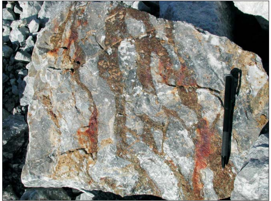
Figure 2. Streaks of sphalerite in dolomite. Pen for scale.