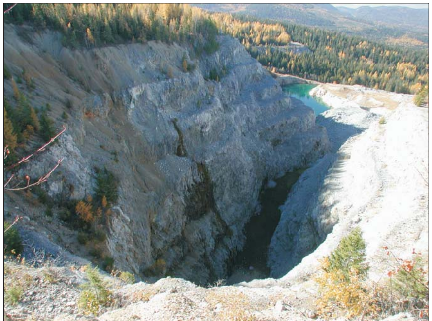
Figure 3. Overview of the North pit (foreground) and West End pit (background) with pit lake. View to the west.

covery until Hecla Mining Co. took an option on it in 1926, the owners worked the property periodically. These efforts were frustrated by two problems, which only became clear as time and development progressed: (1) The mineralization in the Van Stone orebody is approximately 90 percent zinc and 10 percent lead. Since no mill had been constructed to separate the fractions, the material shipped to lead smelters carried a steep penalty for zinc content. (2) The mineralization contains discontinuous streaks of high grade in places, followed by barren ground or narrow stringers and isolated pods and disseminations. The spotty mineralization created a substantial operations problem for a small-scale underground operation.