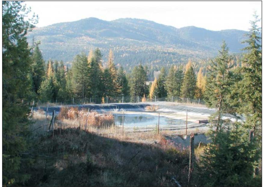
Figure 27. Waste-water retention facility near the Lower tailings pond. View to the southwest.