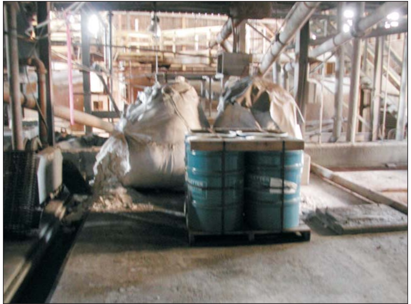
Figure 18. (left) Copper sulfate spill in soil. Mill door in background. View to the north.