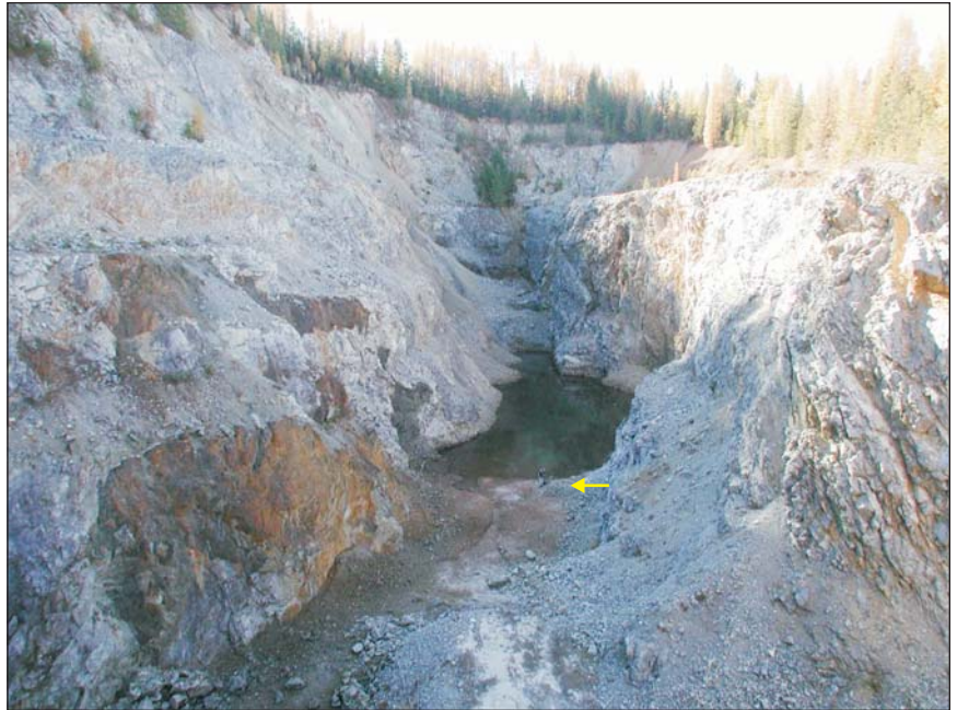
Figure 6. South pit. Geologist for scale (arrow). View to the south.

The South pit (Fig. 6) is smaller and structurally in better condition than either end of the North pit. It lies 130 feet above