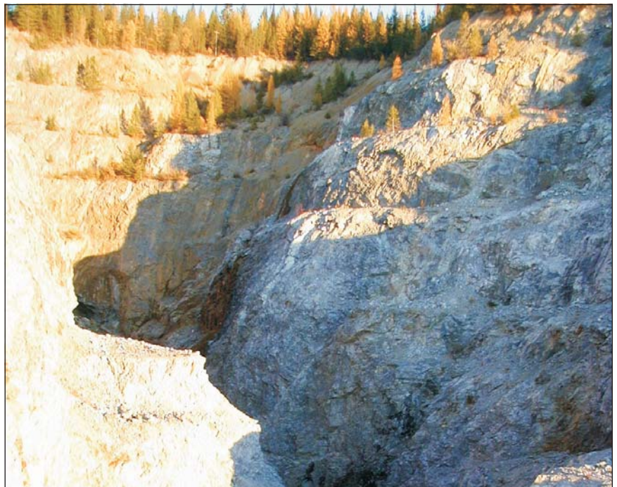
Figure 5. North pit. View to the east.