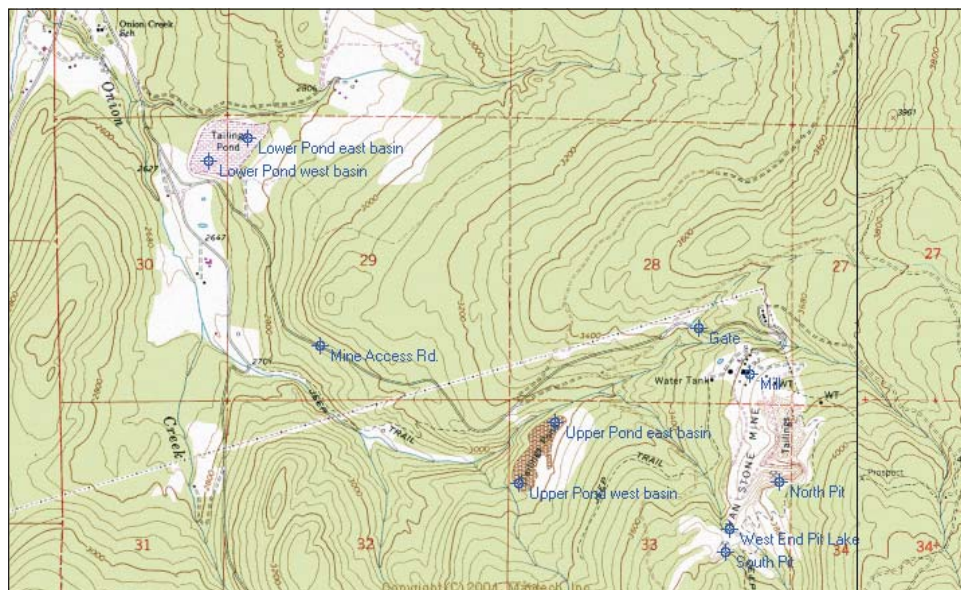
Figure 1. Map showing the location of the Van Stone mine in Stevens County (top) and a more detailed map of the mine site showing the tailings impoundments (bottom). Section lines are 1 mile apart.